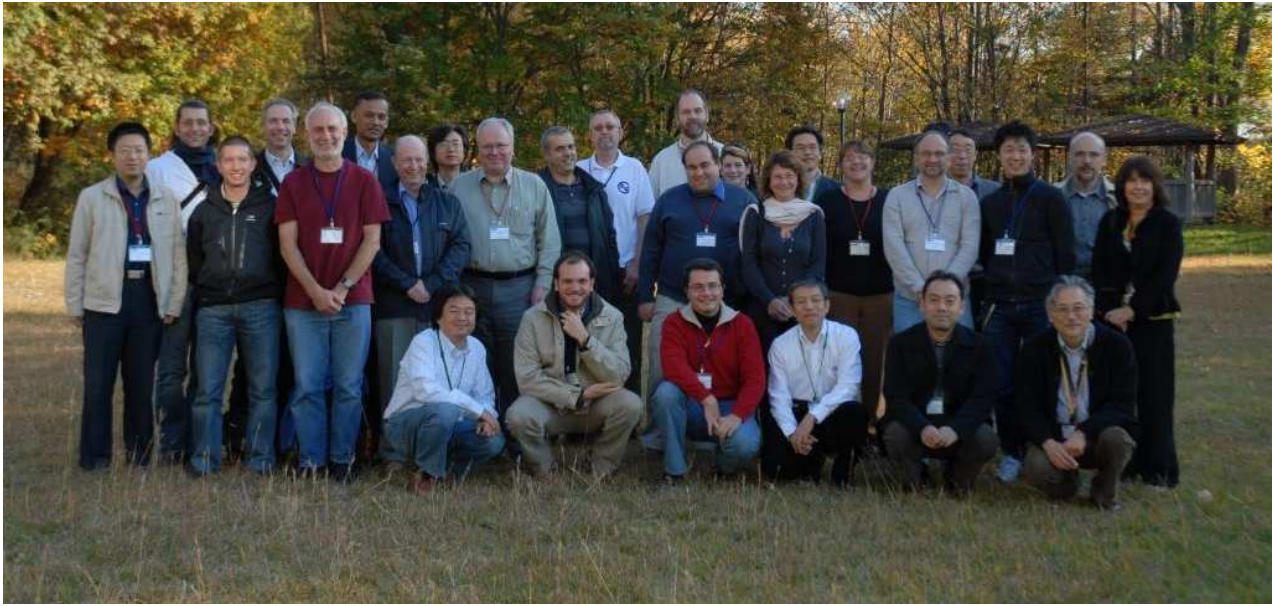
Figure 2: Example of a full-width figure showing the JACoW Team at their annual meeting in 2008. The figure carries a multi-line caption which has to be justified, rather than centred.